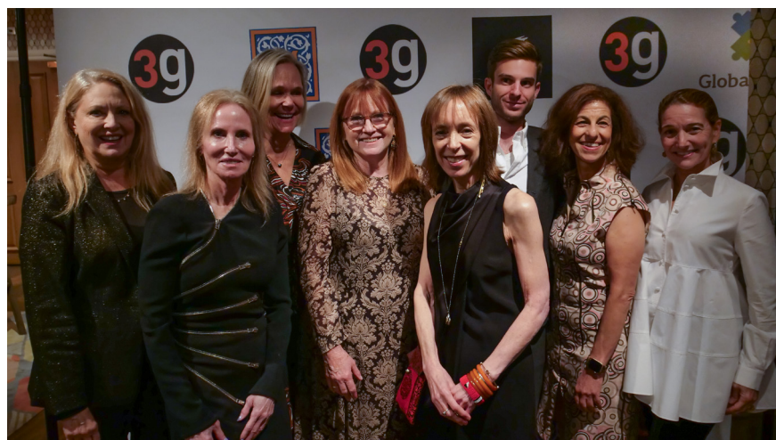
Photos from 3G's 15th Year Anniversary Fundraiser at the Crosby Street Hotel