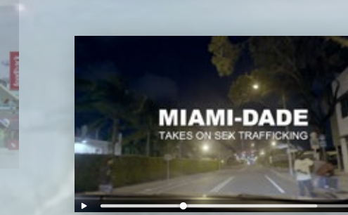
Miami-Dade Takes on Sex Trafficking

North Dakota regulators approve Dakota Access Pipeline